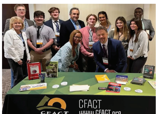
CFACT's team of interns and staff at the Heartland ICCC conference, of which CFACT was a major co-sponsor.