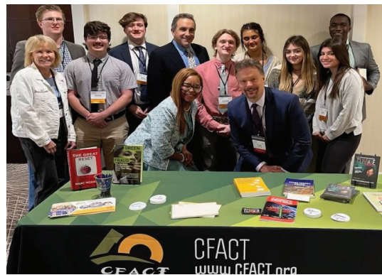
CFACT's team of interns and staff at the Heartland ICCC conference, of which CFACT was a major co-sponsor.